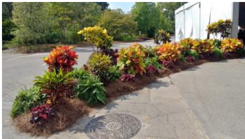
A Colorful, Vibrant Entry