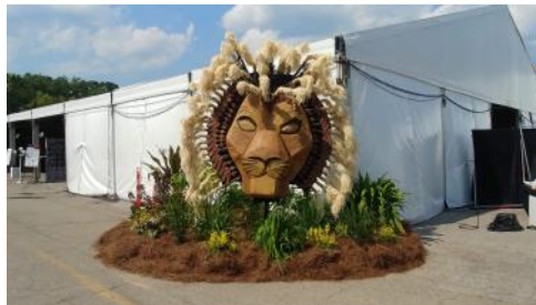
The King of Beasts Guards the Tent