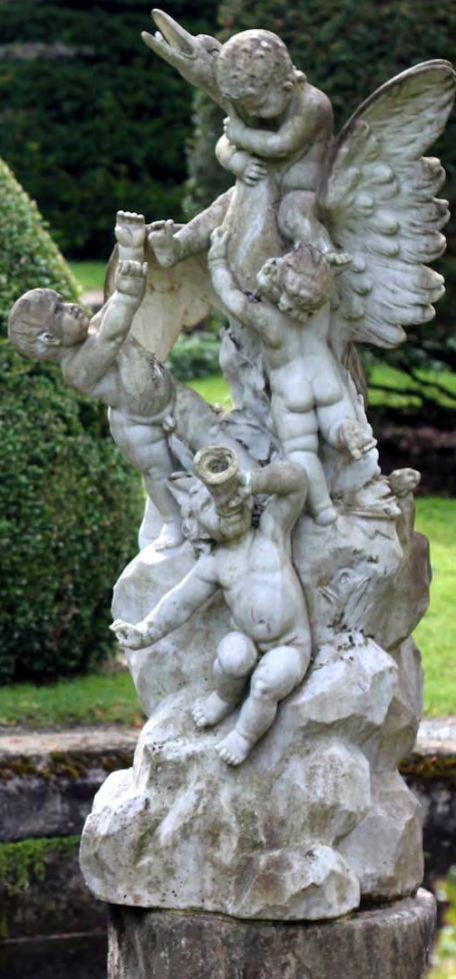
Farmleigh House, Dublin