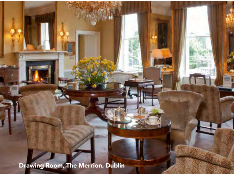
Drawing Room, The Merrion, Dublin