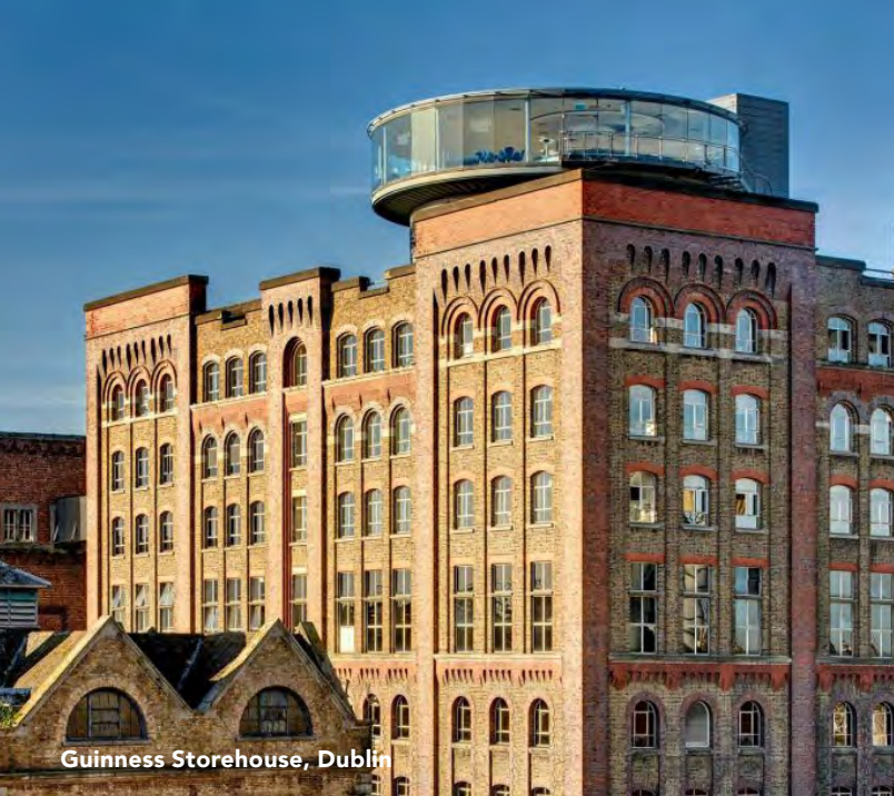
Guinness Storehouse, Dublin