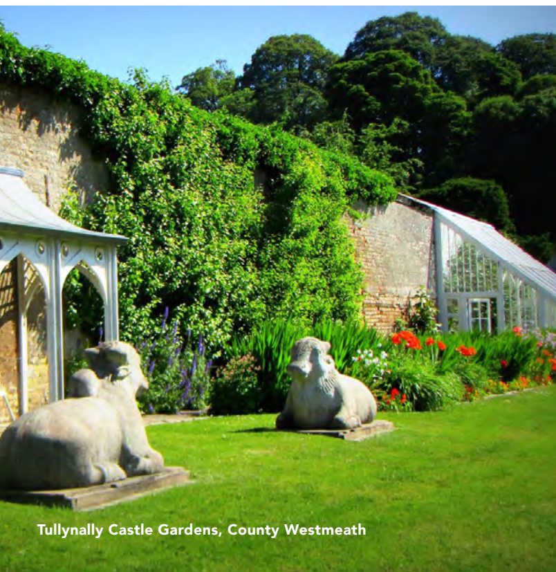
Tullynally Castle Gardens, County Westmeath

This morning, depart Dublin for County Westmeath. Experience a private tour of a beautiful castle and gardens dating back over 350 years, originally occupied by the Earls of Longford in the 17th century. Today, this estate serves as the family home for three generations and features beautiful gardens and magnificent parklands. Stroll through its walled Flower Garden and Chinese Garden. Our private tour will be led by the estate's current owner, a passionate gardener and a writer of historical books and, more recently, about trees. Lunch will be included as part of your visit. Return to Dublin via County Meath. Enjoy a visit to a unique whiskey distillery to learn all about their family traditions and unique distilling processes. Savor a special tasting before returning to your hotel. This evening is at leisure. B,L