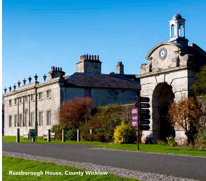
Russborough House, County Wicklow