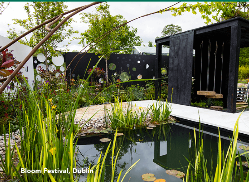
Bloom Festival, Dublin