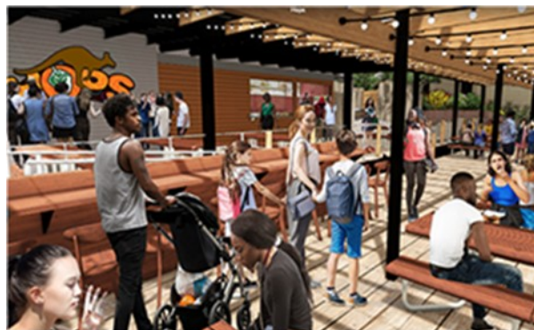
Rendering of beer garden deck at Hops

In addition to the great selection of local craft beers, Heidelberg Distributing will offer a national rotating tap with Goose Island (Chicago, IL), Breckenridge (Breckenridge, CO), Elysian (Seattle, Washington) and Golden Road (Los Angeles, CA). There are also plenty of new food offerings as well including artisanal flat bread pizzas, oven-roasted meatballs and marinara, caprese salad, oven-fired chicken wings, roasted cauliflower and shareable pub pretzels and beer cheese. Grab and go menu items will be available for visitors who would rather snack as they stroll around the Zoo.